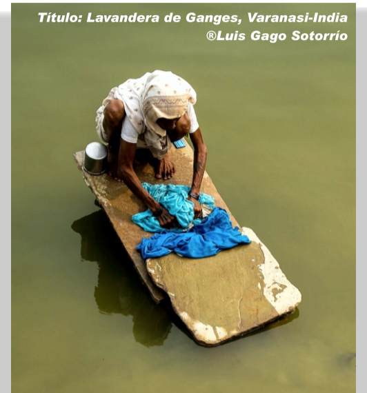
Título: Lavandera de Ganges, Varanasi-India