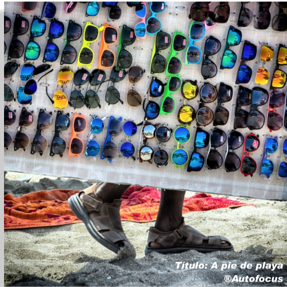
Título: A pie de playa